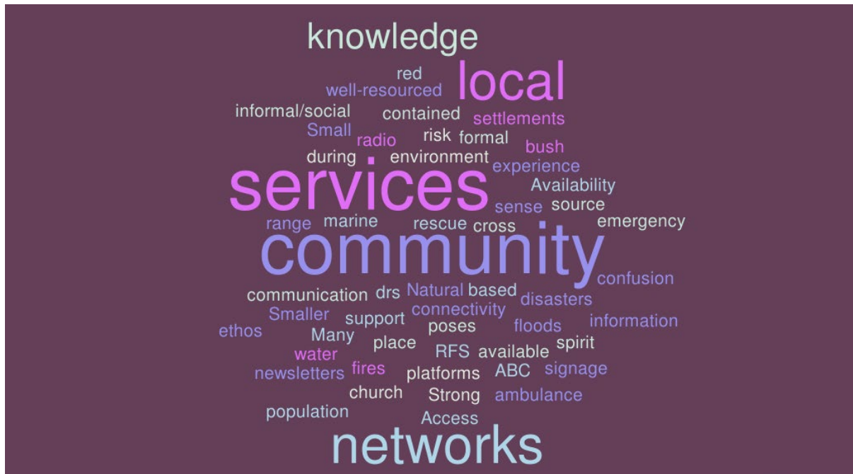
Figure 2. A Word Cloud Showing the key Strengths of the Sussex Inlet and District Community.

Strengths refer to positive Sussex Inlet & District's attributes that could be built upon in order to improve its ability to withstand and recover from disruptive events and achieve a higher degree of community resilience.