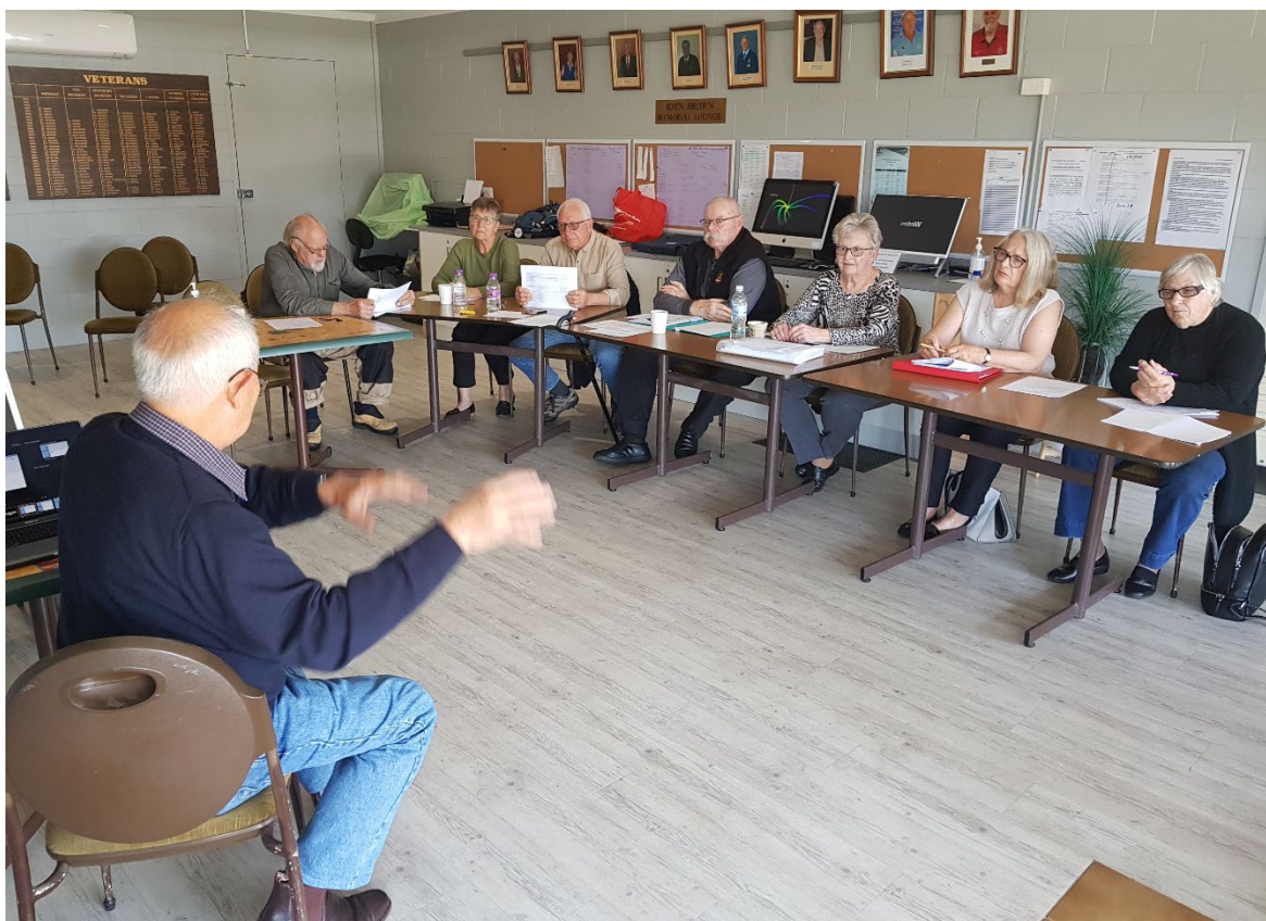
Image: Members of the Sussex Inlet and District Community-based Resilience Group During a Workshop (Griffith University)

Due to time constraints, the Working Group was unable to address some detailed aspects dealing with implementation and communication aspects of the Sub-strategy. These matters will be addressed after the finalisation of the Whole-of Shoalhaven strategy.