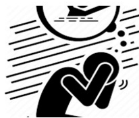
INCREASED INCIDENTS OF PTSD AND LACK OF SUPPORT