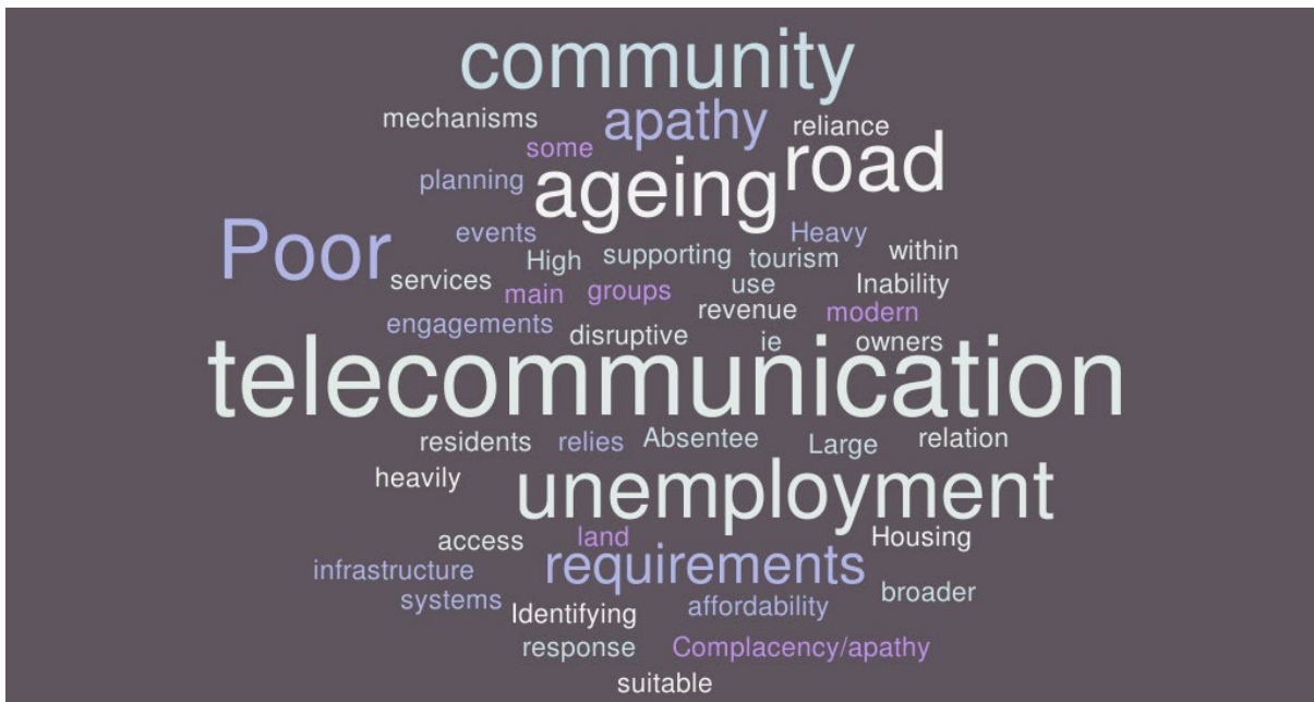
Figure 2. A Word Cloud Showing the key Weaknesses of the Sussex Inlet and District Community

Weaknesses refer to negative Sussex Inlet & District's attributes that will need to be countered in order to improve its ability to withstand and recover from disruptive events and achieve a higher degree of community resilience.